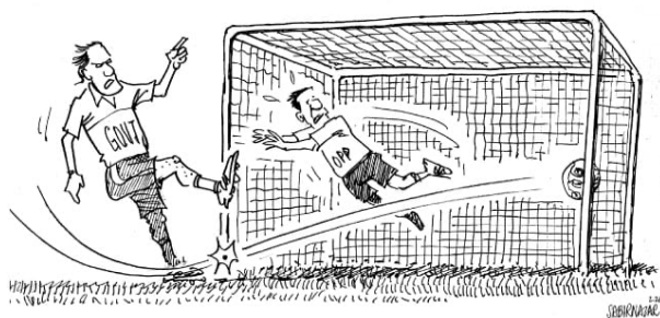
RS18.8TR EXPANSIONARY BUDGET SAILS THROUGH NA