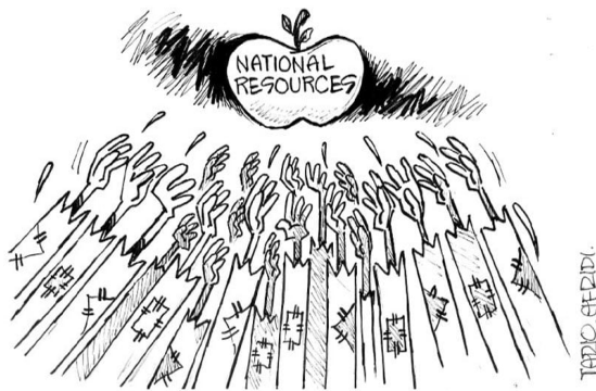
POPULATION MAY HIT 390M BY 2050: OFFICIAL REPORT