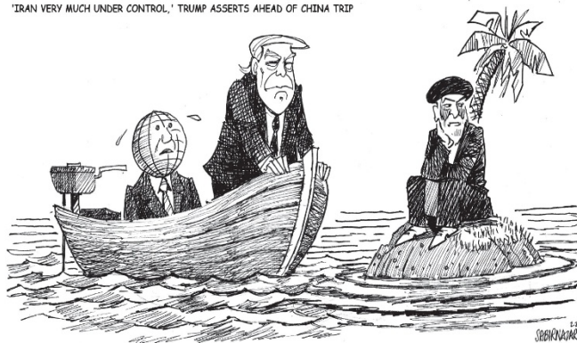
'IRAN VERY MUCH UNDER CONTROL,' TRUMP ASSERTS AHEAD OF CHINA TRIP